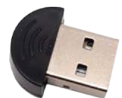
Blue tooth dongle