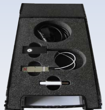
Complete kit in a protective carrying case

Therefore it is very important to measure the pressure exerted by the carbon brushes regularly.